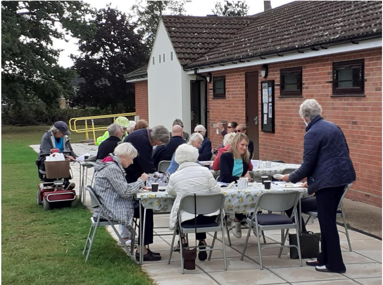
Seymour Pavilion coffee morning with residents reading copies of the draft plan, 2020