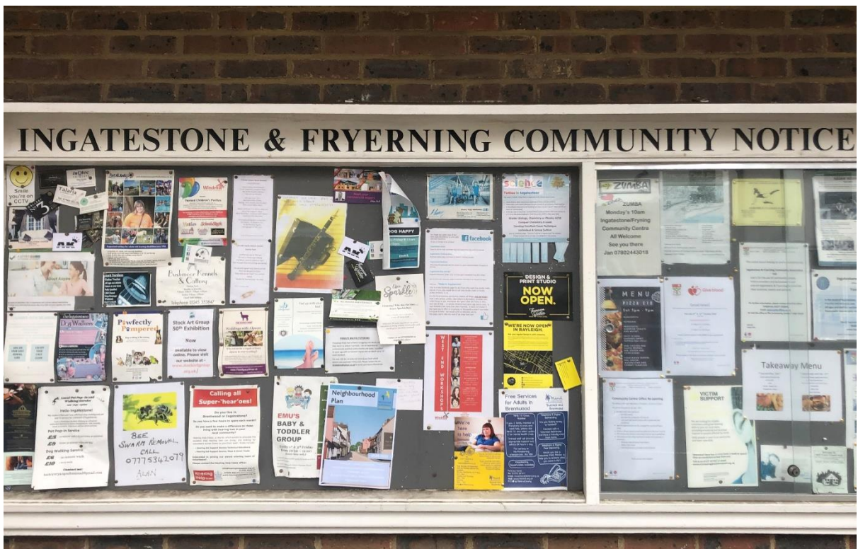
Flyers displayed in the Parish notifying the public of Regulation 14 consultation.